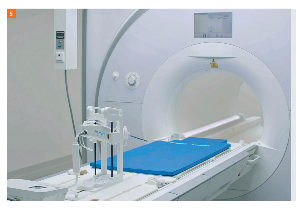
Figure 5: TULSA-PRO® system: The ultrasound applicator and robotic positioning system are inside the scanning room on the MRI bed.

Immediate post-ablation, contrast enhanced MR image shows the non-enhancing prostate.